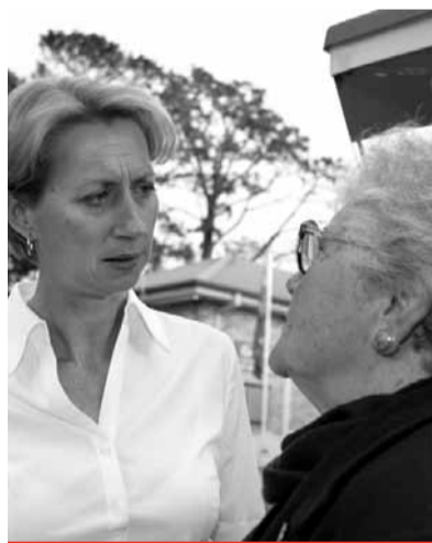
Through compulsory 9% employer contributions, Labor established the current superannuation system.

The proposals are subject to consultation, which is still underway. A summary of the Government's discussion paper is available from my office.