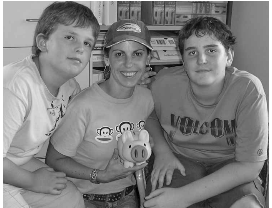
SaverPlus is a great way to help families save for the children's education.

97% of SaverPlus participants reached their savings goal in 2005!