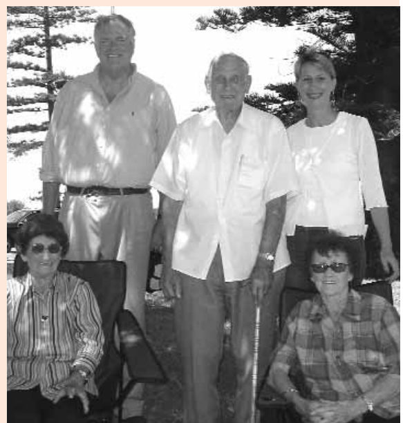
Labor's Ageing policy paper provides a positive national vision for older Australians.

We don't want older people in Australia to feel they are a burden on younger generations. If we act now with sensible and practical solutions we can prevent population ageing becoming a crisis.